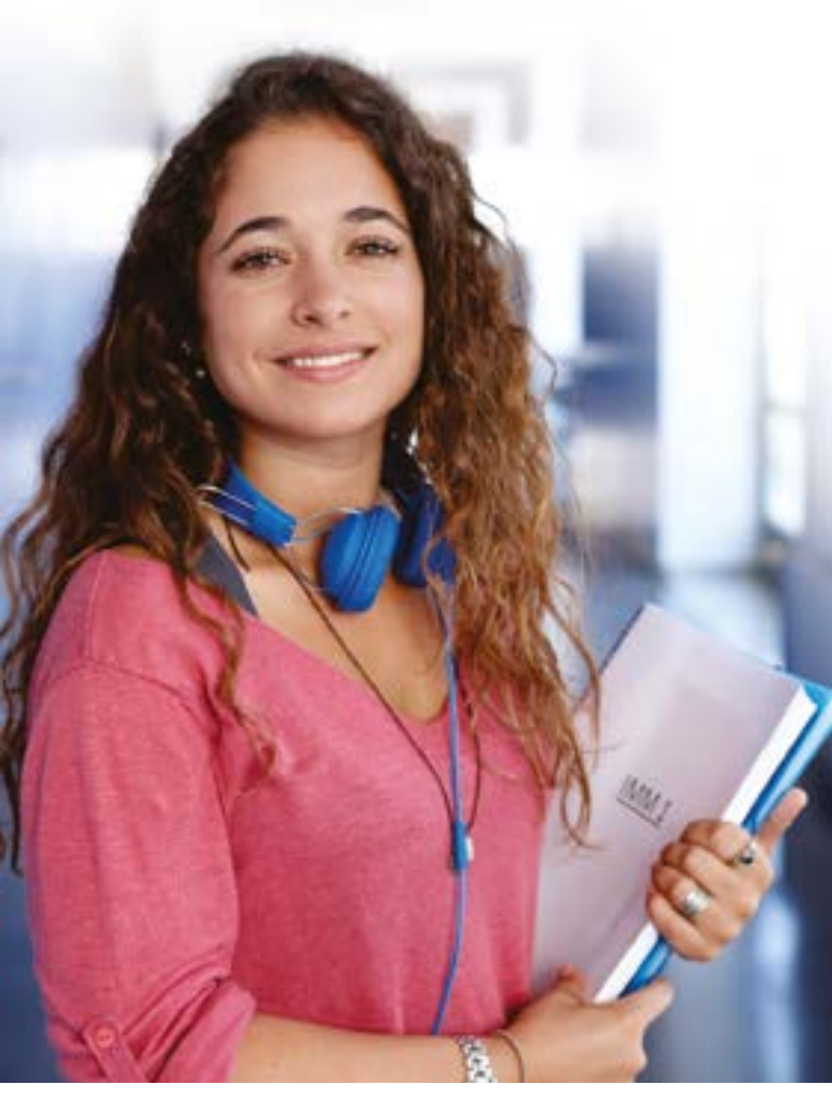
The key to essential English